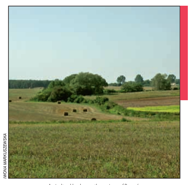
Agricultural landscape, the environs of Poznań.