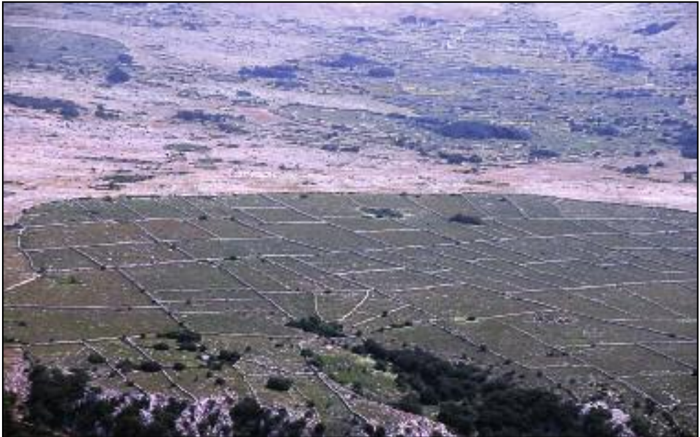
Figure 7: Landscape of regular dry stone walls.

cattle breeders fenced small forest and pasture plots to serve as shelter (Novosel Žic 1987). Basic units are round or moderately elongated in shape, occurring in various dimensions and their integration has resulted in complex structures with various recognizable patterns (Aničić et al. 2004). Outstanding characteristics of this landscape as well as the high degree of identity stem from adaptability to extreme natural conditions. Nowadays, abandoning of cattle breeding is causing overgrowth of these structures.