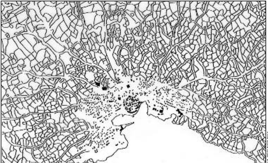
Figure 3: Irregular stone walled terraces (detail – olive tree plantation).