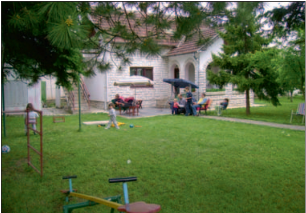
Figure 1: Individual village households.