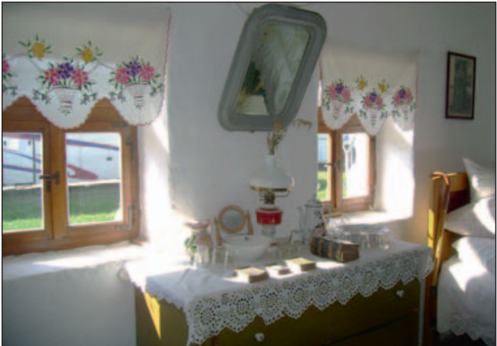
Figure 2: Ethno-house in Belo Blato.

Ethno-houses are houses with additional buildings, such as tool sheds, barn, »cheese house«, around them built in the traditional style of folk architecture, not only Serbian, but also of other ethnic groups living in Serbia, such as Bunjevci Croats, Slovaks, Romanians, Croats. These houses have elements of individual and privately owned farms based on traditional agricultural activities, but also on multi-ethnicity, folklore, old customs, and heritage. There are several characteristic ethno-houses.