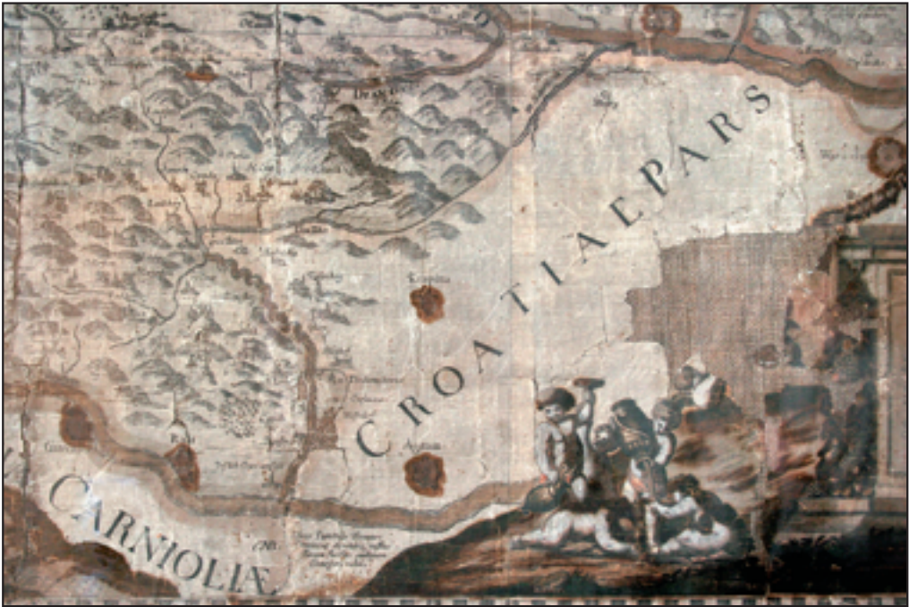
Figure 1: Section of Styriae Ducatus Fertillissimi Nova Geographica Descriptio . Georg Matthäus Vischer, 1678. Map Museum of the Anton Melik Geographical Institute of the Scientific Research Centre of the Slovenian Academy of Sciences and Arts.