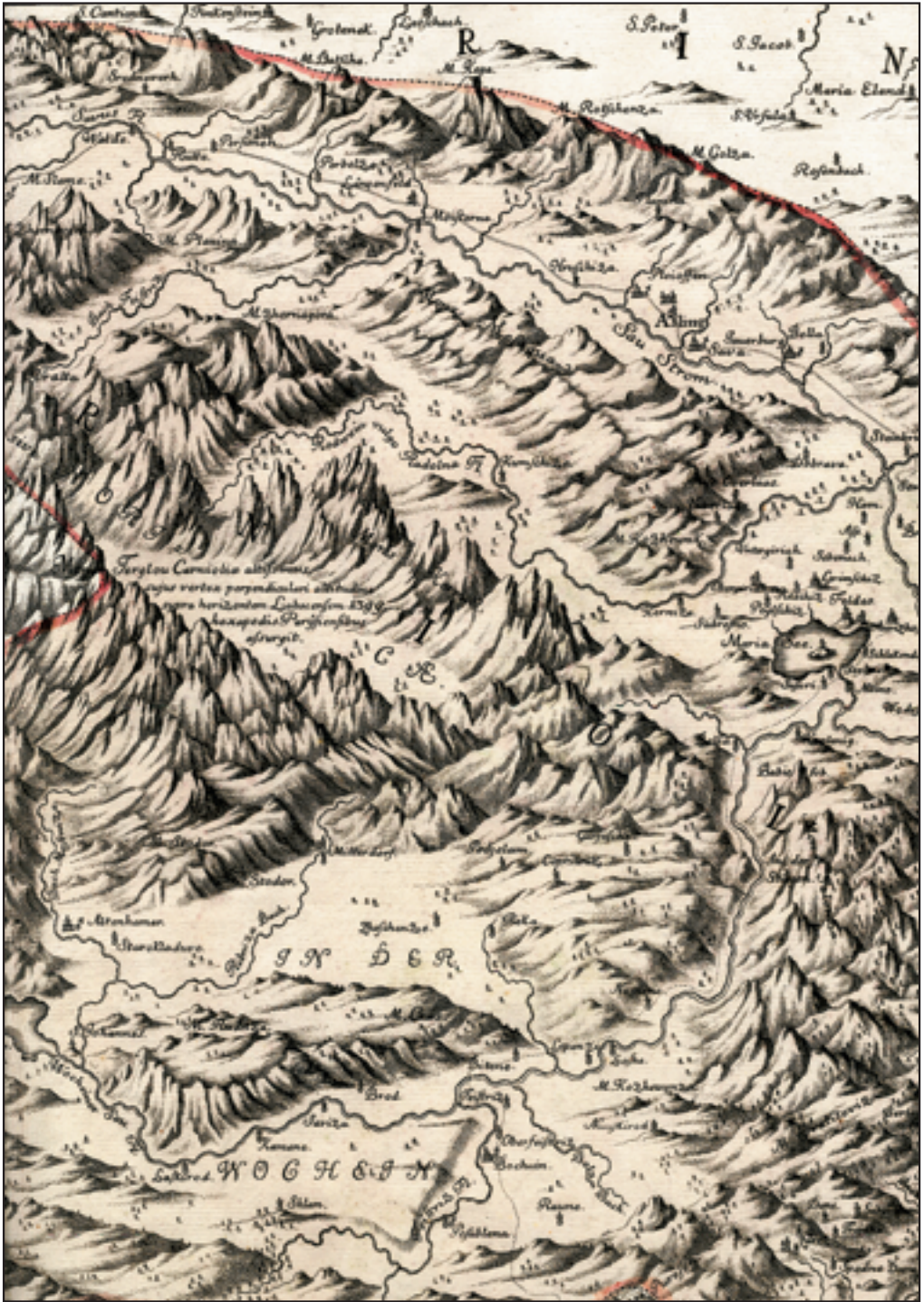
Figure 2: A section of Ducatus Carnioliae tabula chorographica . Janez Dizma Florjančič, 1678. Map Museum of the Anton Melik Geographical Institute of the Scientific Research Centre of the Slovenian Academy of Sciences and Arts.