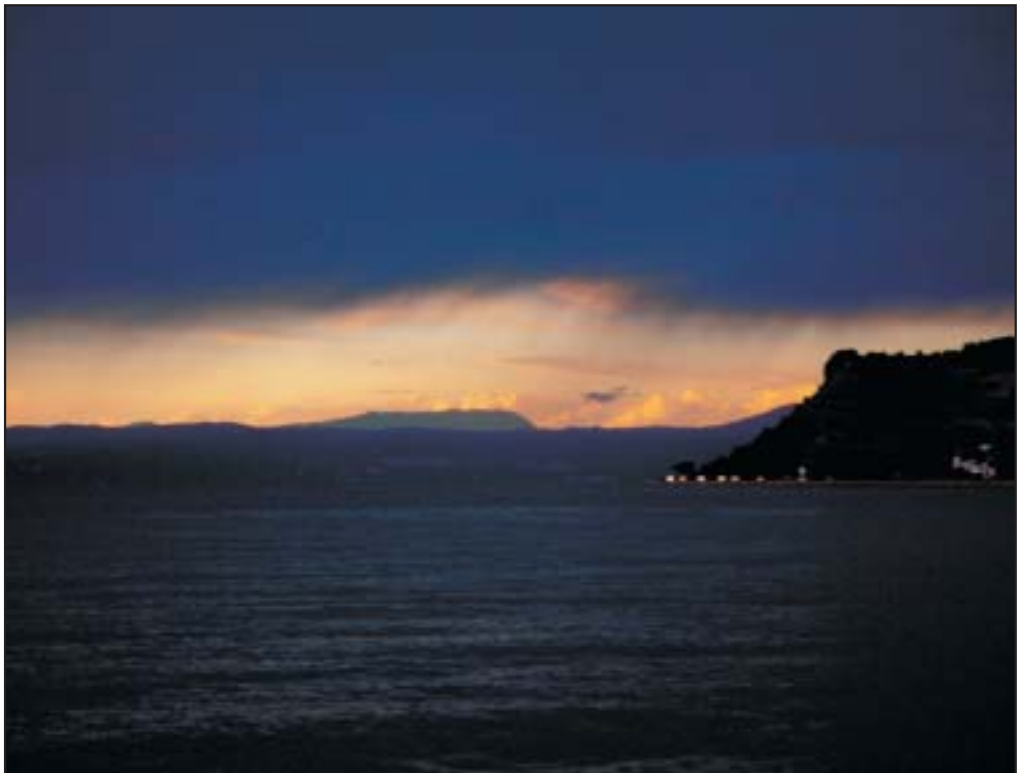
Figure 2: A storm above the Gulf of Koper.

As to the occurrence of exceptional weather events in sub-Mediterranean Slovenia, the 17 th and the 18 th centuries were the worst in the last millennium. Among the numerous rigours of the weather that