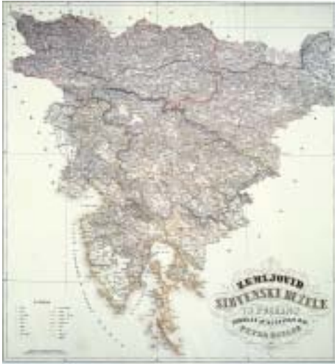
Figure 2: Kozler's Map of Slovene land and provinces , printed in 1853, is the first map to display the ethnic territory of Slovenes. Due to its politically controversial nature, it was not published until eight years later.

was published as the third map in the first bundle, was printed in 1869, when the state had already borne the official name of Austria-Hungary for two years. It had just passed through two successive periods of serious internal political crises brought on by the severe defeats in the wars in 1859 and 1866, by means of which the Habsburg Court had intended to prevent the union of Italy and Germany. The first military catastrophe at the end of the 1850s caused a tectonic shift in the internal politics of the Habsburg monarchy. The bell had tolled for the absolutist regime, and there began a constitutional and state parliamentary and provincial parliamentary political life which was still far from democratic. This also marked the beginning of a new stage in the development of the Slovene national movement, which Bogo Grafenauer justifiably called »the affirmation of Slovene national integrity« (Čepič 1979, 964).