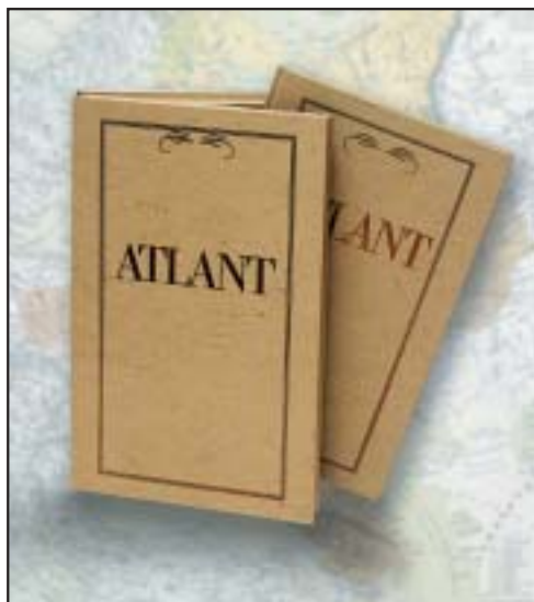
Figure 1: A facsimile of Atlant , the first atlas of the world in the Slovene language, which was published in a series of map sheets issued periodically from 1869 to 1877.

Our intention in this article is to examine the first atlas of the world in the Slovene language as a source for the analysis of the time, space, and culture in which it appeared. We hope to highlight and evaluate