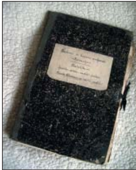
The folder where the original maps of Atlant were found.